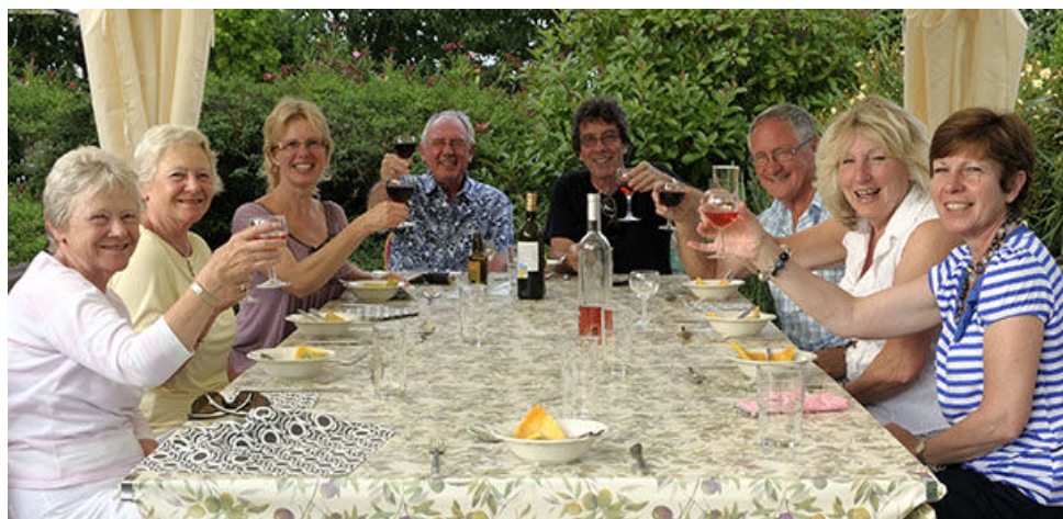
sampling the local cuisine Chez Nous - "Bienvenue en France et bon appetit!"