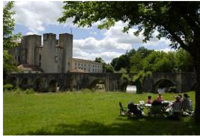
picnic lunch by the Roman bridge and Henry IV's towers at Barbaste