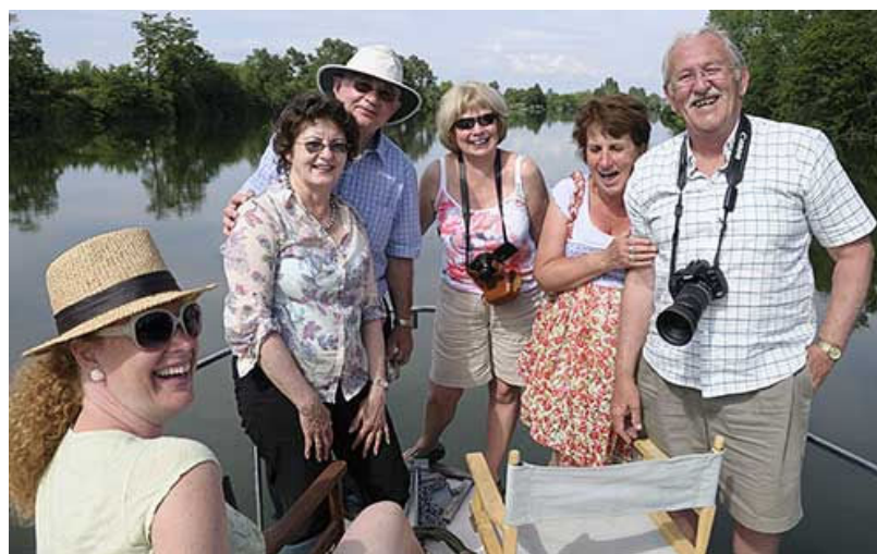
Clients from Canada, England and Wales enjoy a surprise bonus boat trip on the River Lot