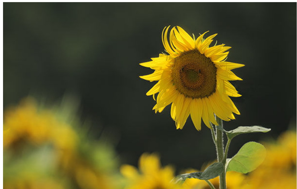
genuine photograph - 'smile' not created in Photoshop - click image to see magnified view of sunflower head

It's not just our sunflowers, everyone who comes here always has a great big smile on their face!